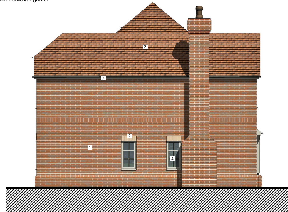
Side Elevation - northeast